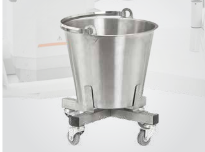
Stainless steel bowl with castors