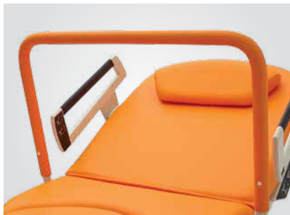
Supporting upholstered bar