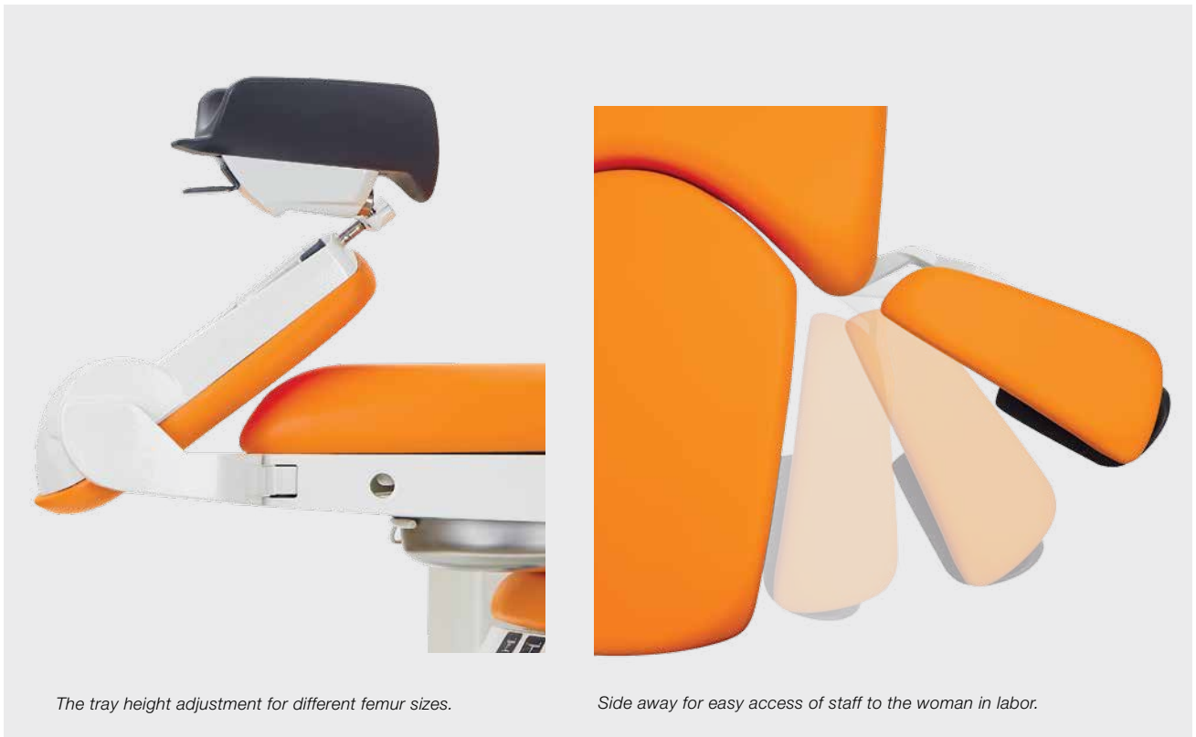
The tray height adjustment for different femur sizes.