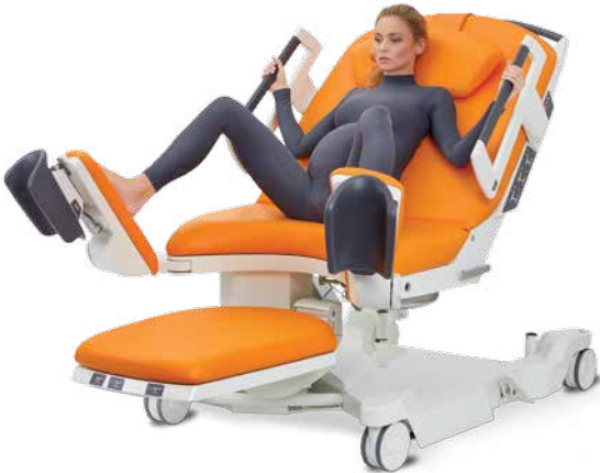
Semi recumbent position with the feet rested on the leg rests