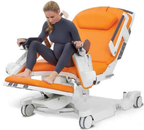
Half sitting using leg holders