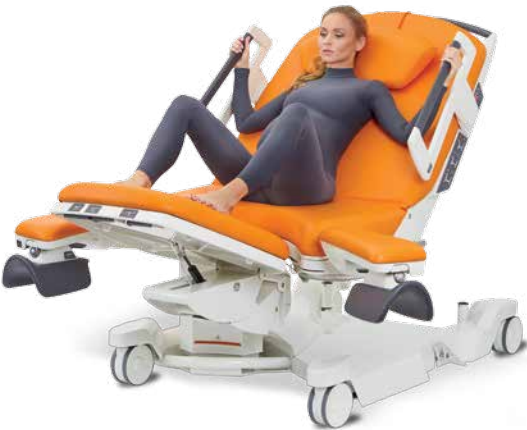
Semi recumbent position with the feet rested on the foot section