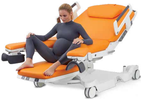
Half sitting using foot section