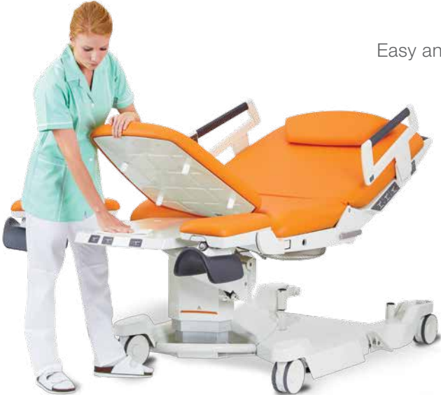
Easy and quick to clean.