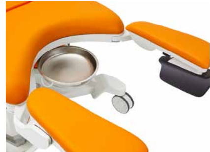
Sliding stainless catch basin 4.5l