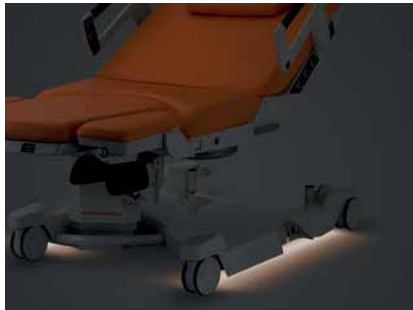
Under bed light