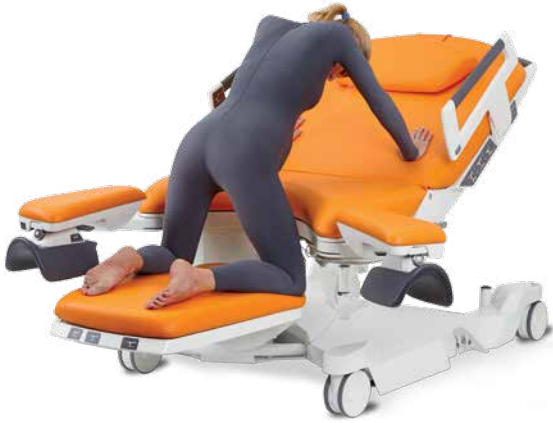
All fours position