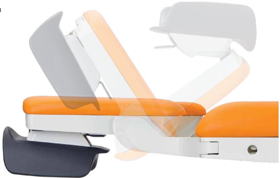
Quick adjustment of the leg rests into the required position.

The firm conception of leg rests enables the care team to respond very quickly and effectively to different situations which may occur during the delivery.