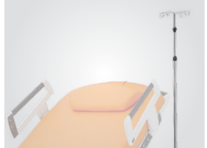
Telescopic infusion stand