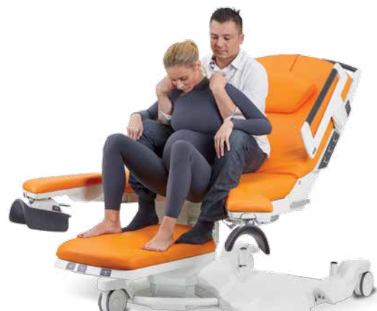
Half sitting with partner assistance