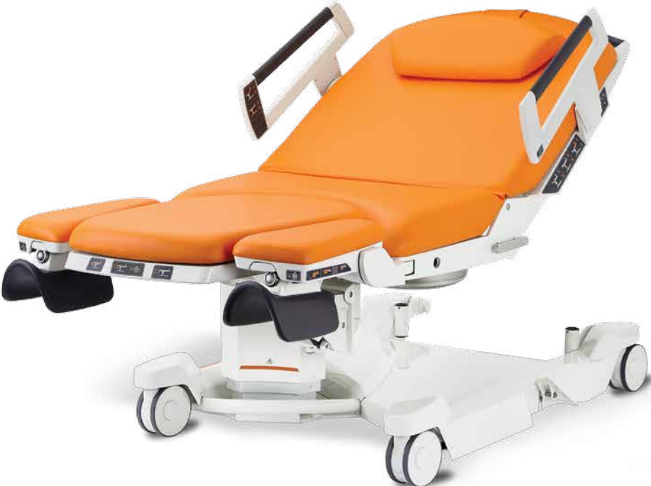
Attractive and functional design in the first impression.

Birthing bed AVE 2 is perfectly suitable for labor, delivery, recovery and postpartum in the childbirth phases, so women in labor and their families can complete normal childbearing feeling like being in their homelike rooms.