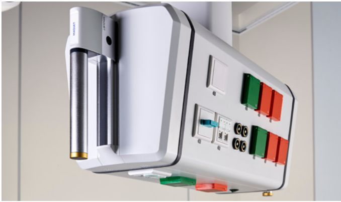
Three panels for outlets and sockets (including underneath).