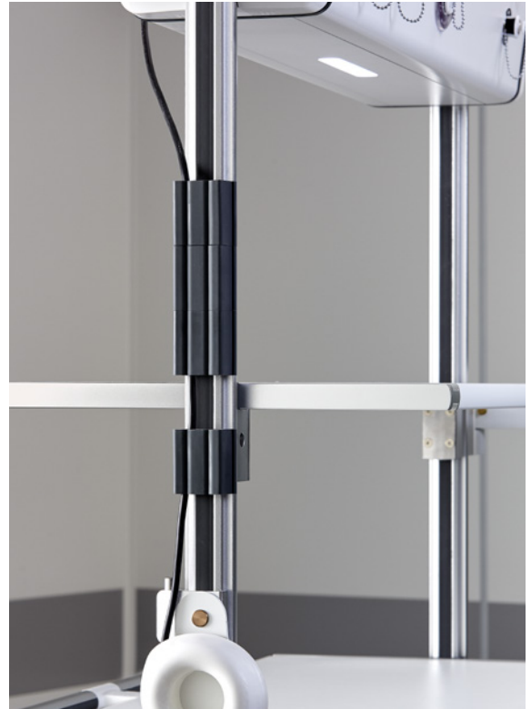
Smart cable management.