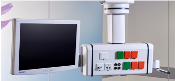
Full range of accessories available.