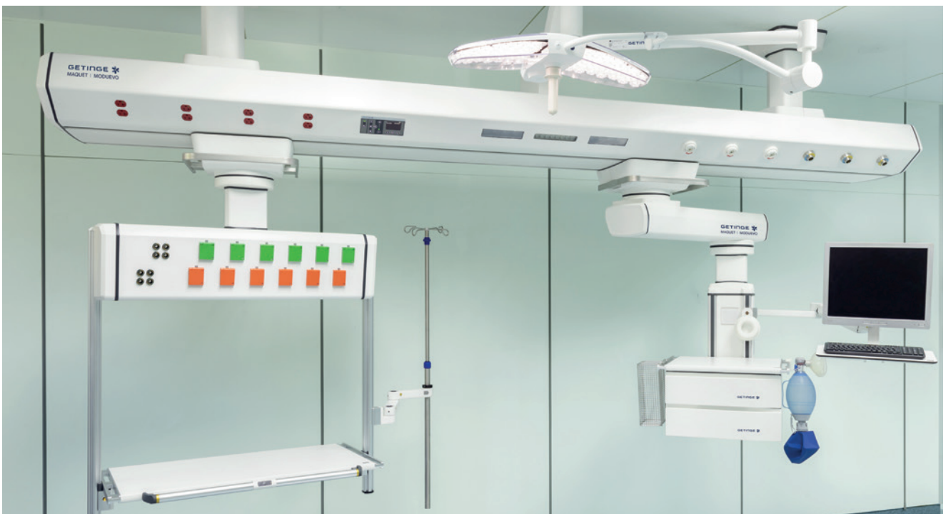
Premium solution with Sky Module.

Getinge has developed a horizontal solution to accommodate architectural constraints: Moduevo Bridge. This economical, space-saving ceiling supply unit is designed to enhance provider-patient interactions at all acuity levels by keeping everything close at hand. It can be installed in intensive care and high-dependency care units, recovery and emergency departments.