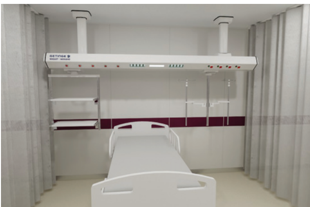
Rack & pole solution.

The Somnus light has been developed according to the Lighting Research Center Recommendations. Bluish tones simulate morning light, while reddish ones represent evening light (based on the Circadian Stimulus).