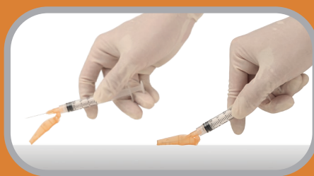
activation against hard surface

Two options for activation of the protective arm: